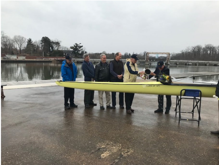
CAPTION: 71'ers christen 'Class of 1971" shell