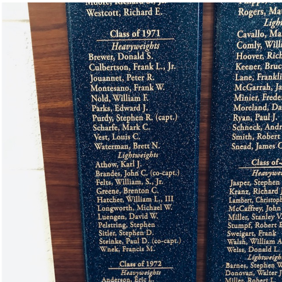
CAPTION: 71 Crew letter winners

Of particular note the Navy '71 Crew "Great 8" was the first crew since the class of '60 Olympic team to win the Eastern Sprints in 1971 - a feat that has not been matched to this day!