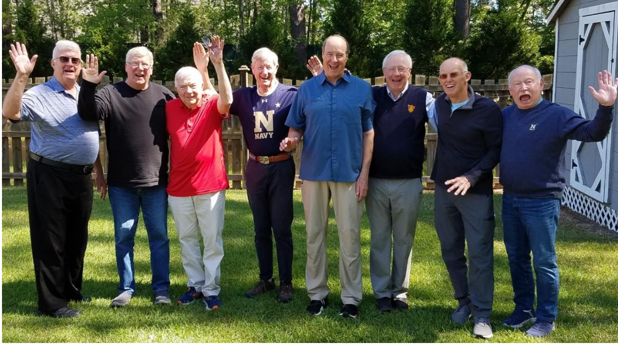
7th CO at 3rd 2.5 reunion in Summerville, SC