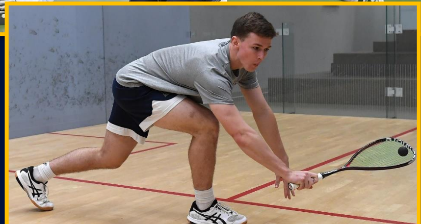
Men's Squash “Doubles” National Champs