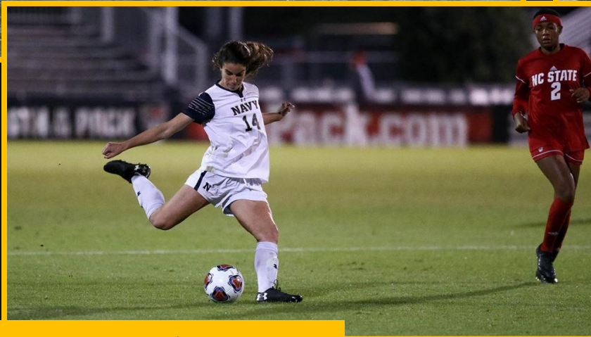
Patriot League Champions