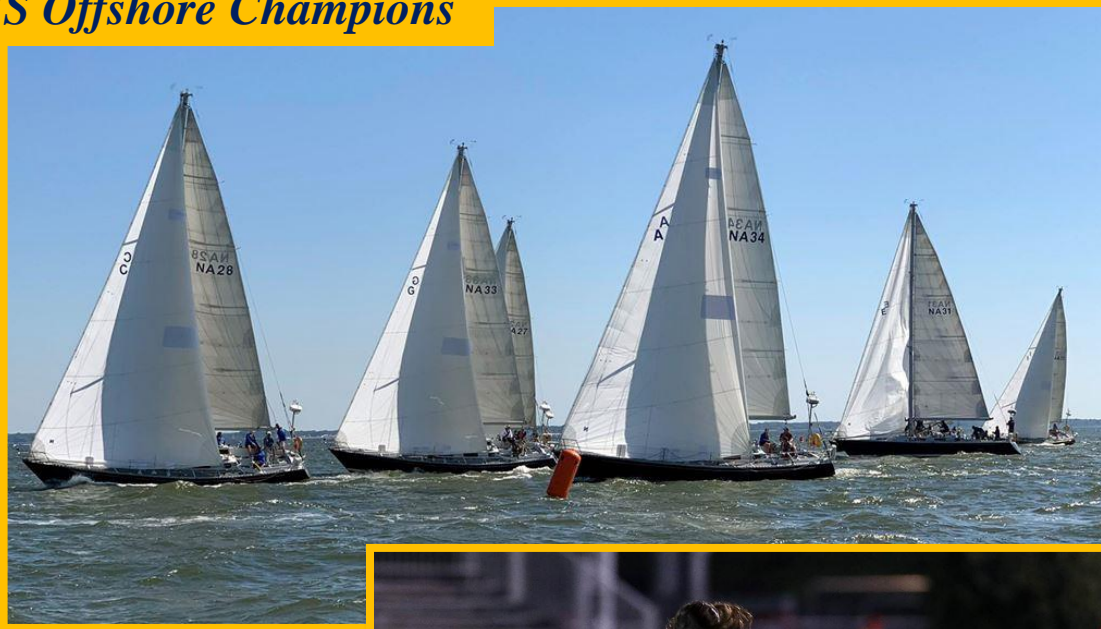
US Offshore Champions