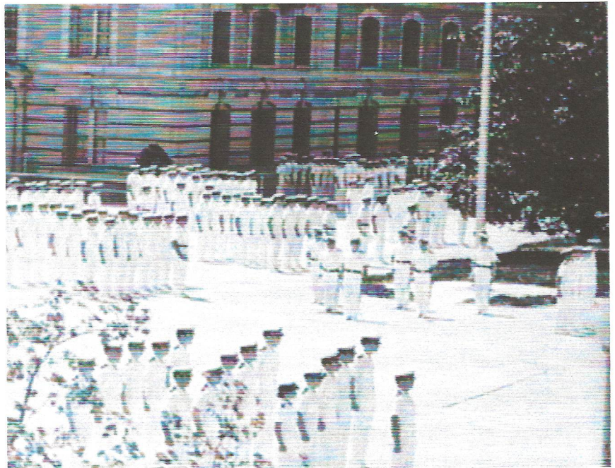
Class of 1980 – June Week