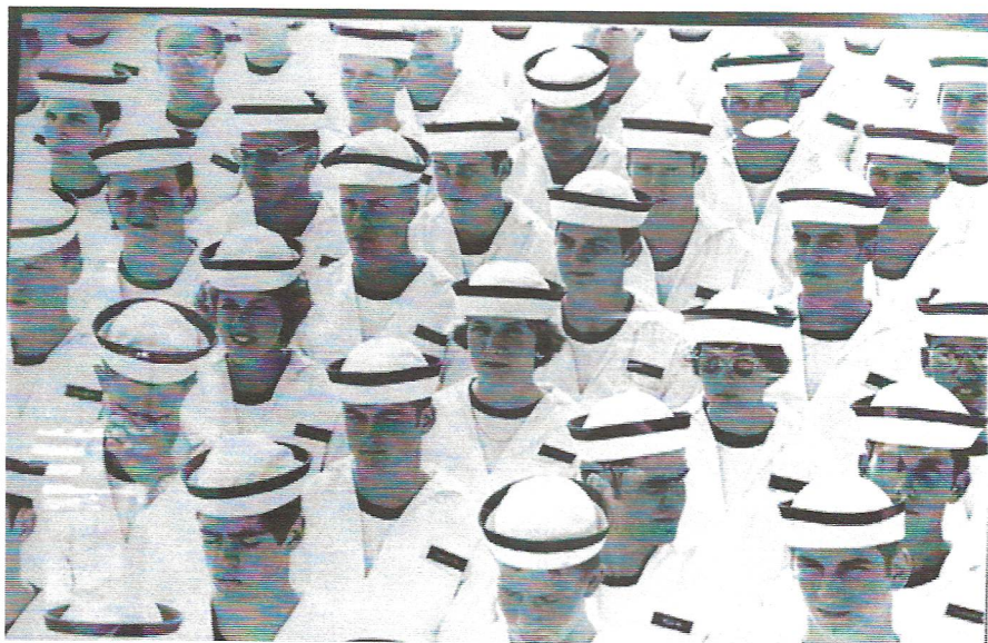
Class of 1980 - I-Day