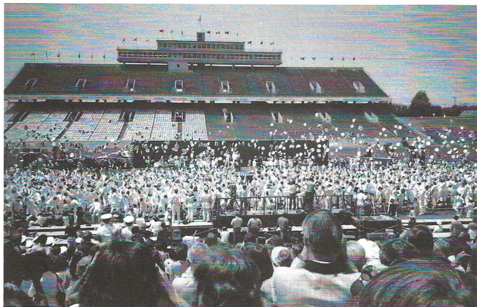
Class of 1980 - Graduation