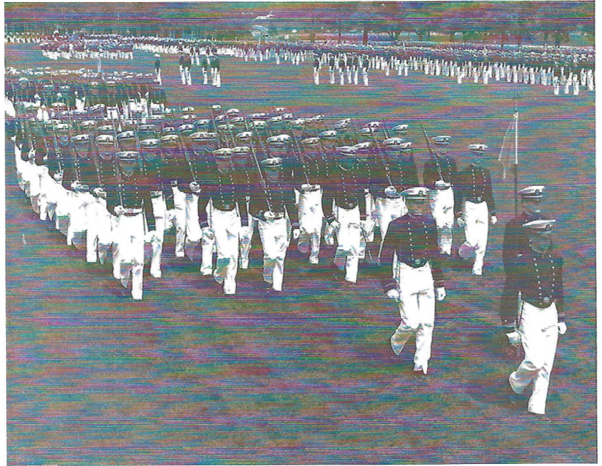
Class of 1980 – Pass in Review!