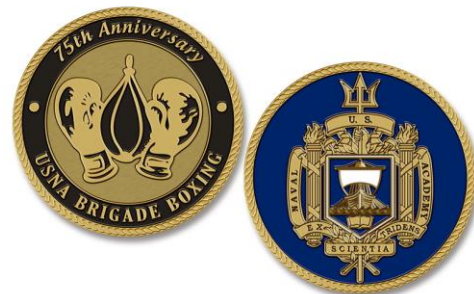
Photo #1: “Commemorative challenge coins for the 75th Brigade Boxing tournament”