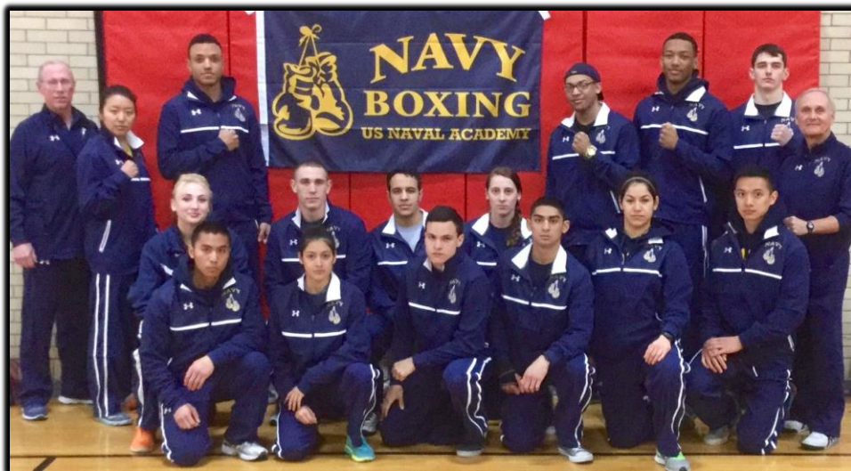
Photo 75#5: "2016 Navy boxers wearing their new Under Armor warmups"

in April. Thirteen were regional champions (including all seven Navy women) and the other three advanced as at-large selections.