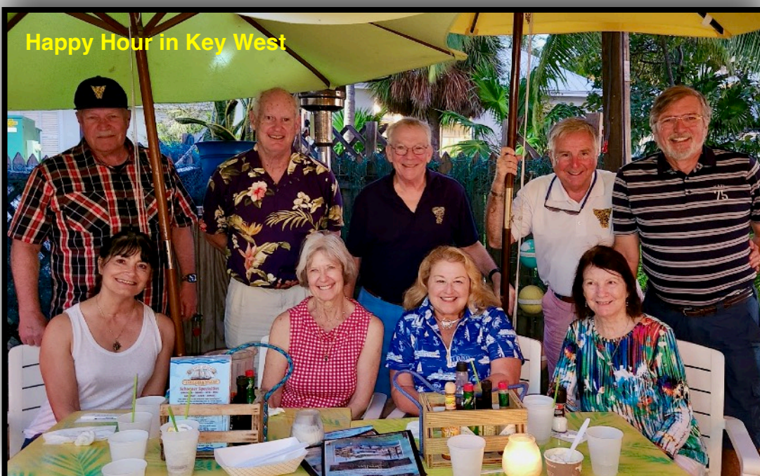
Happy Hour in Key West

Enjoy your summer — and make some time to drop a few lines to your Scribe.