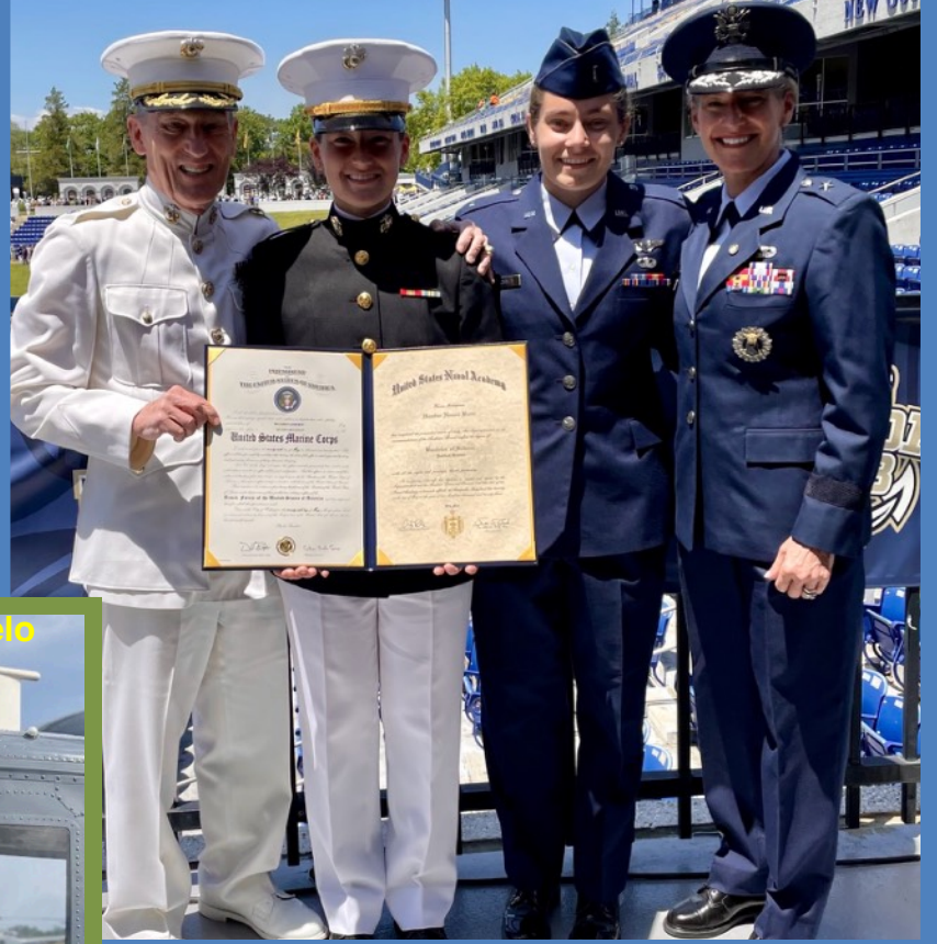
Born family at Heather's USNA graduation