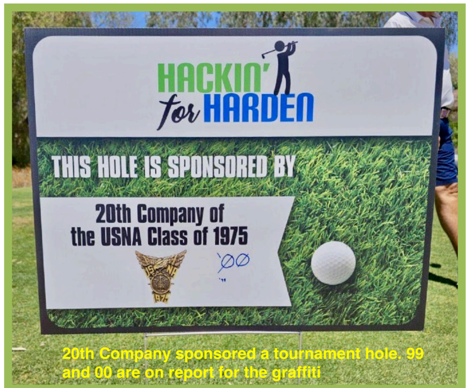
20th Company sponsored a tournament hole. 99 and 00 are on report for the graffiti