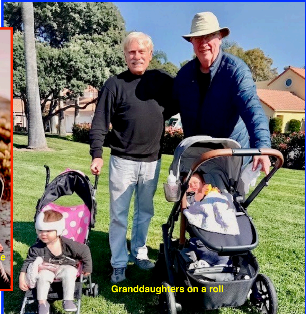
Granddaughters on a roll