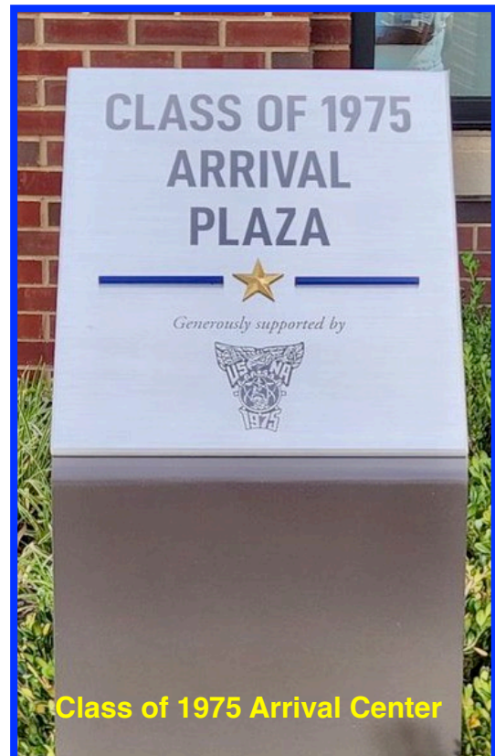
Class of 1975 Arrival Center