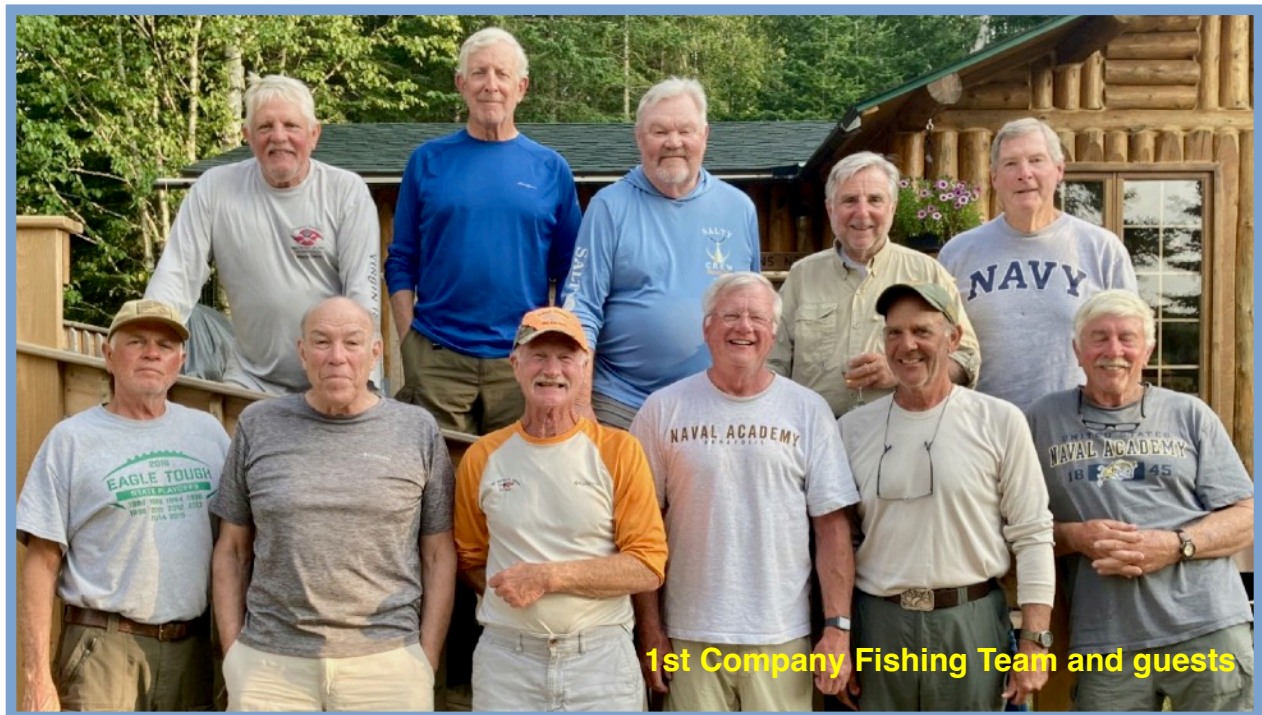
1st Company Fishing Team and guests