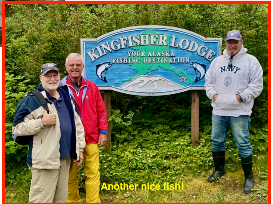
Another nice fish!

biographies, and total disrespect shared by all. That people can remember Plebe year stuff so vividly 53 years later is amazing. Although the fishing wasn't as good as in past years, a great time was had with the help of plenty of beer and