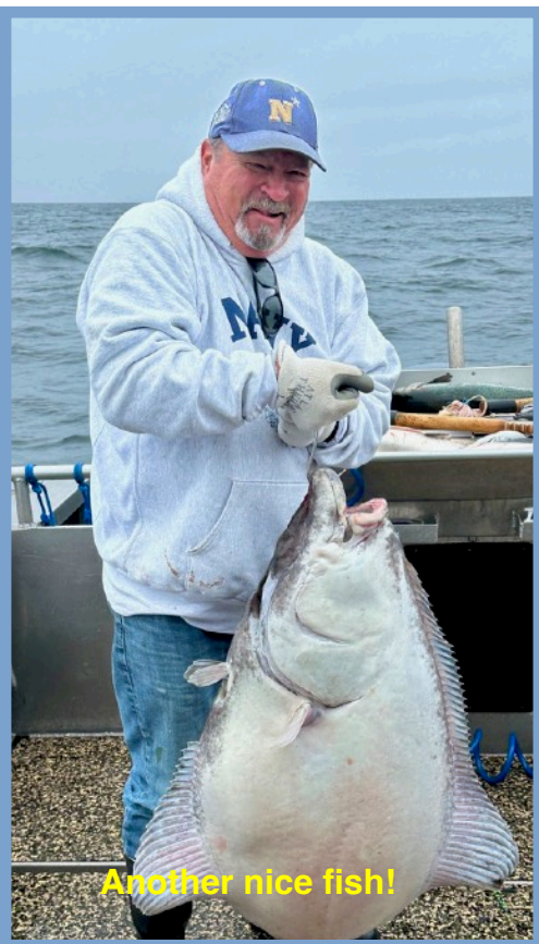
Another nice fish!