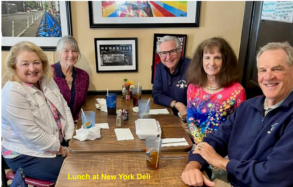
Lunch at New York Deli

them once in the past 20 years! It was a great effort, but it was thrilling to travel through the small, sometimes twisty, rock channels into a wondrous world of art and history (plus some bat guano). Each of the seven pyramid interiors visited provided amazement along with hunched backs and bumped heads. While leaving us hot, sweating and out of breath.